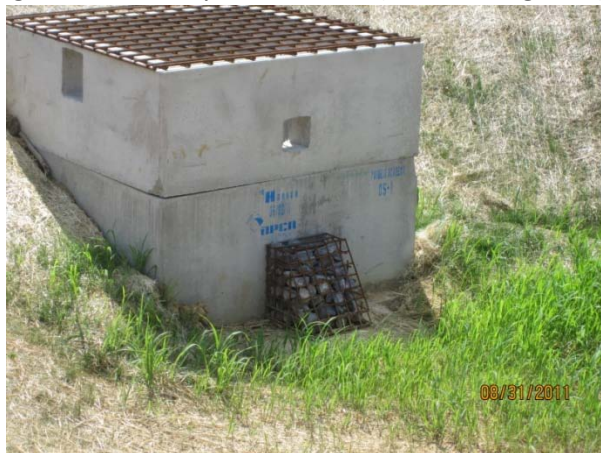
Figure 2. Unacceptable hole & sediment filter arrangement at bottom of riser and sediment pond.