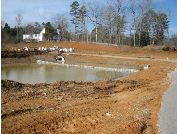
Figure 4. Sediment basin with bermed forebay.

turbulence, spread out incoming concentrated flows, and allow larger particles to settle out in a more concentrated area before entering the main basin zone, thus making cleaning easier and more accessible.