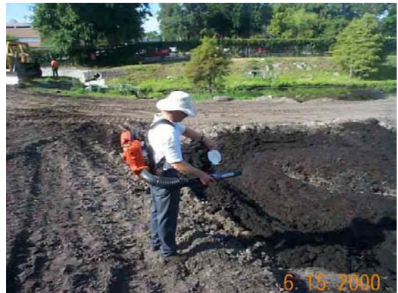
Figure 9. Application of flocculant powder to thicken bottom sediment slurry.