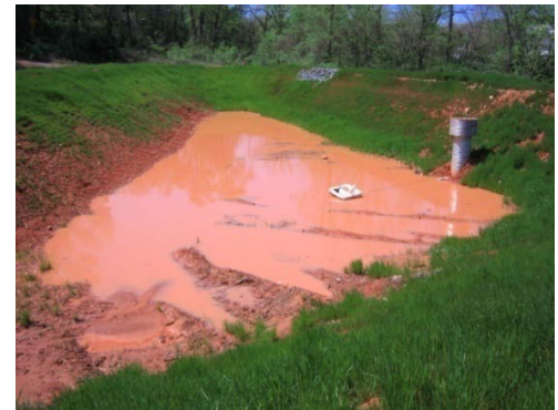
Figure 5. Floating surface dewatering installation.