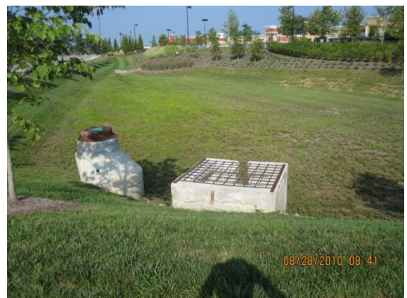
Figure 7. Landscaped and well-maintained permanent stormwater detention pond.

Permanent stormwater detention basins are designed mainly to limit post-construction flood peaks to pre-construction peak conditions to prevent downstream flooding. TDEC's 2010 Phase II Small Municipal Separate Storm Sewer Systems (MS4) permit, applicable to approximately 85 Tennessee cities and counties, requires the development, implementation, and enforcement of local stormwater management programs, including minimum permanent stormwater controls involving runoff reduction and pollutant removal, by 2014. The MS4 program requires that stormwater discharges from new development and redevelopment sites be managed such that post-development hydrology does not exceed the pre-development hydrology at the site, in accordance with performance standards established by the MS4. TDOT is also included in the Phase II program, but cannot enact ordinances and codes.