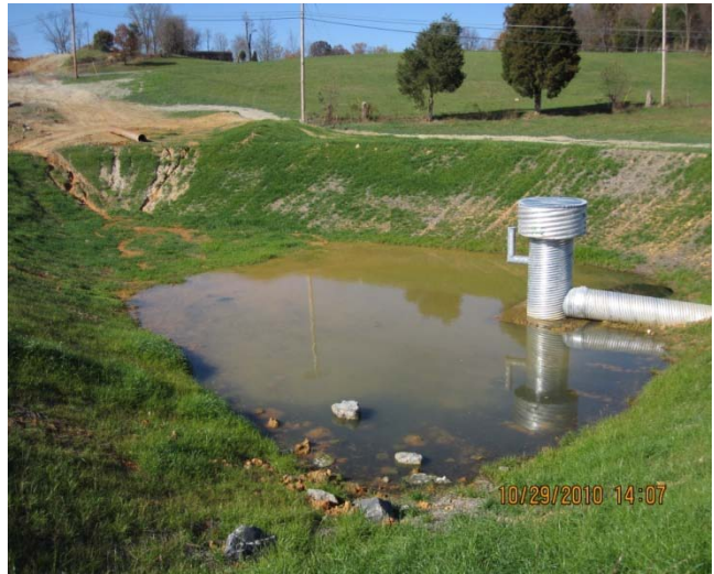
Figure 1. Typical sediment basin with dewatering device.