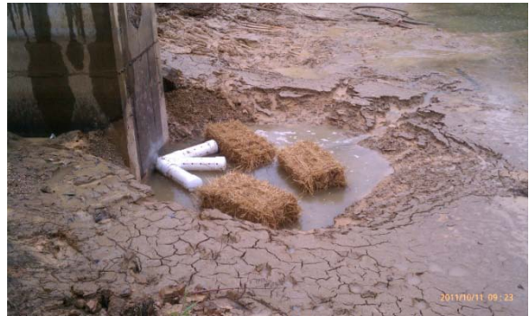
Figure 8 illustrates a condition where a sediment basin was converted to a detention pond without removing the accumulated sediment. Figure 8. Former sediment basin converted to a stormwater detention pond without removing sediment.

One TDEC field official reports that sediment basins are sometimes left unconverted, not cleaned, and abandoned in the sediment basin configuration. Occasionally, improperly constructed sediment basins having an open outlet hole at the bottom of the pond or riser, and therefore not having functioned as effective sediment-retaining structures, may not receive much attention to sediment removal and transitional treatment, other than perhaps removing an ineffective pile or basket of rock in front of, or rock filter ring around, the hole. In other cases, once construction is finished, the dewatering structure is simply removed at the permanent pool level of the sediment basin, without demucking or removing the accumulated sediment, and the basin is ill-advisedly transformed into a stormwater retention pond, thus allowing the construction phase sludge to be resuspended and released with each successive storm.