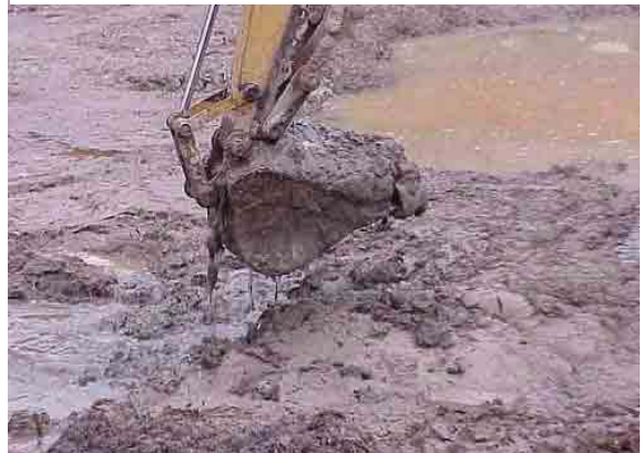
Figure 10. Removal of thickened bottom sediment.

Florida , in its Erosion and Sediment Control Manual Designer and Reviewer Manual (2007), outlines a simple procedure based on the above APS guideline, for PAM-enhanced mud and sediment removal from sediment basins: