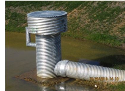
Perforated dewatering device attached to principal spillway.

II. Another, less effective, dewatering device is a perforated or slotted vertical pipe or tubing attached to the principal spillway riser at the permanent pool elevation and designed to draw down or dewater the volume of water between the riser crest and permanent pool over a recommended period of 72 hours. This device is less effective than a surface skimmer because dewatering takes place over the entire 2 to 3 ft. vertical drawdown column, rather than at the surface. The number, size, and spacing of the perforations need to be determined and specified. A slide gate type of valve or outlet orifice should be used in conjunction with the vertical pipe to achieve accurate drawdown time control.