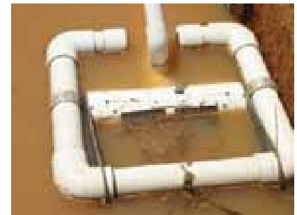
Floating skimmer dewatering device attached to principal spillway.

I. The most effective dewatering device is a floating type of skimmer configured to always draw or skim water through a small orifice opening located just below the water surface until the volume of water between the riser crest and permanent pool is dewatered over the recommended 72-hour period. The orifice in a floating skimmer, protected with a trash screen, is always under constant head and can be properly sized to ensure a constant discharge and accurate dewatering time. A resting pier is constructed beneath the skimmer to establish the permanent pool elevation and to prevent the skimmer from becoming mired in the mud (shown in above basin sketch). Floating skimmer design guidelines and size selection procedures are